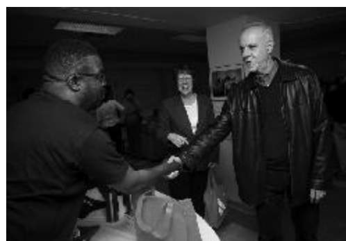
Steve Lopez, author of The Soloist, took time during his recent Philadelphia trip to visit members of the Project H.O.M.E. community at our Kate's Place residence in Center City. During his days as a columnist for the Philadelphia Inquirer, Steve wrote several columns about Project H.O.M.E.

While we continue to struggle with the growing numbers of persons on the streets, we are also making tremendous progress on the development of our newest housing endeavor, St. John's. This joint venture between Project H.O.M.E. and Bethesda Project will provide 79 units of permanent supportive housing in Center City for formerly homeless men and women. We will soon be closing with the Redevelopment Authority of the City of Philadelphia, the Pennsylvania Housing Finance Agency