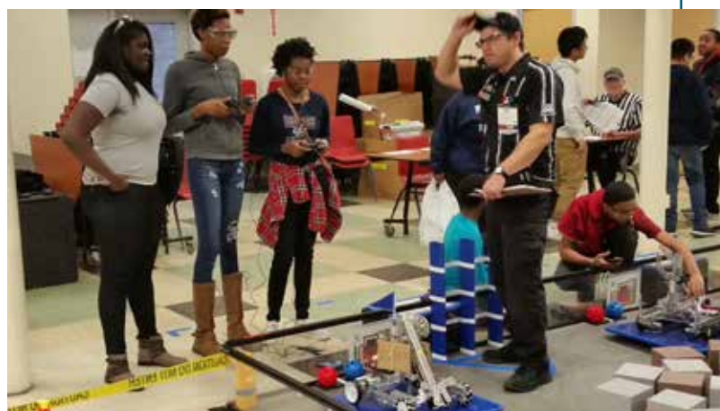
The Teen Program Robotics Team at the Honickman Learning Center and Comcast Technology Labs.

◆ Our Teen Program's new Robotics Team, partnered with the Robolancers from Central High School, took first place in its inaugural scrimmage, kicking off what they hope will be a successful first season of competition. The team, one of over 100 from around Pennsylvania, is taking part in the FIRST (For Inspiration and Recognition of Science and Technology) Tech Challenge where they design, build, program, and operate robots to play a floor game. The initiative allows students at the Honickman Learning Center and Comcast Technology Labs to develop STEM (Science, Technology, Engineering, and Math) skills in an interactive environment.