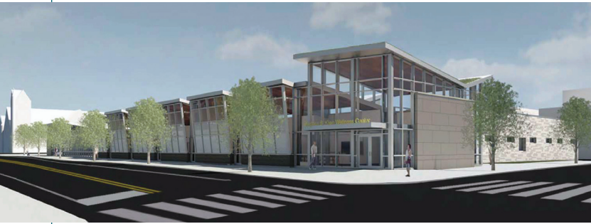
Rendering of our future Stephen Klein Wellness Center